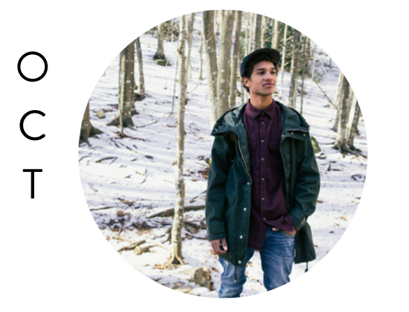
PERSONAL NARRATIVE: CLIMATE 10/3 10/10 10/18